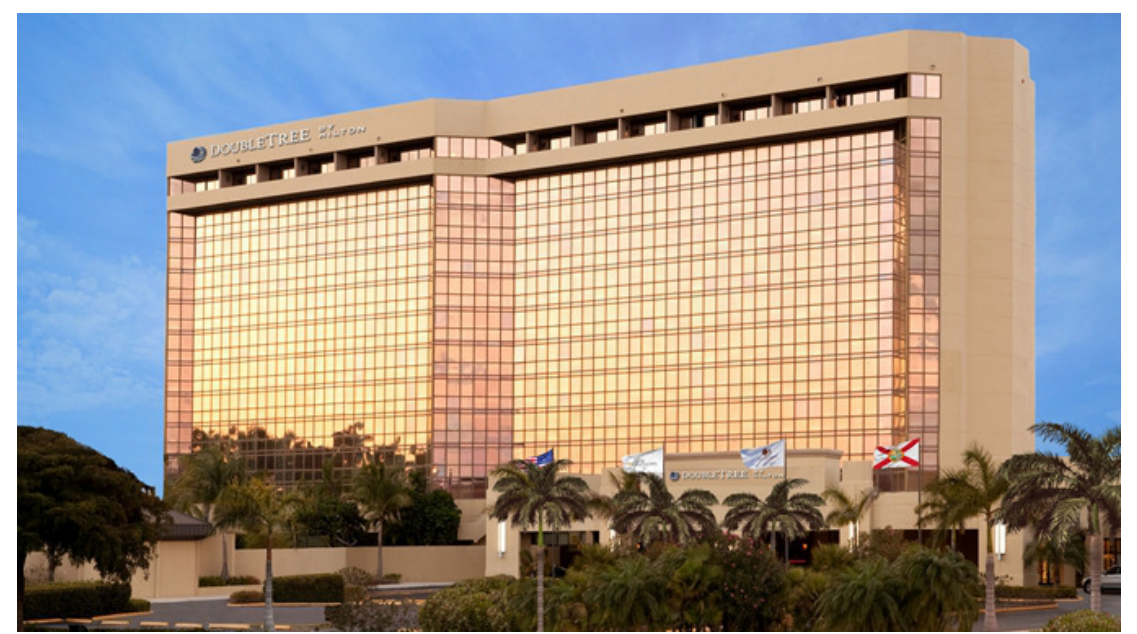
How to reserve your room: Participants are responsible for making own accommodation arrangement. Please make your reservations now.

Participants are responsible for making own accommodation arrangement. Please make your reservations now. Be sure to request our special negotiated rate is $189 per night of the program, plus applicable taxes and local fees.